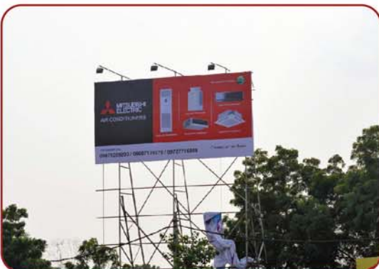
Gujarat Hoarding Activity