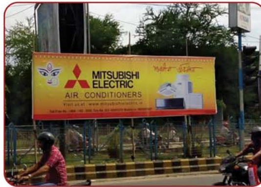
Durga Puja Banners