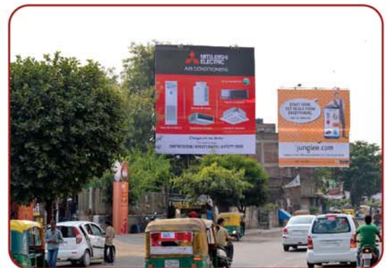
Gujarat Hoarding Activity