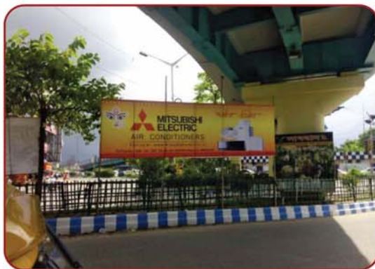
Durga Puja Banners