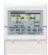
PAR-21MAA- Remote Controller