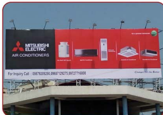
Gujarat Hoarding Activity