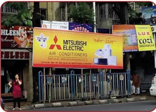
Durga Puja Banners

Festivals bring joy to our lives. Mitsubishi Electric has always been involved with the various festivities across the country. This Durga Puja and Navratri, we planned to use our brand to celebrate the iconic symbol of Maa Durga, to showcase the festival through these installations and bring the community together. Various puja committees were established during Durga Puja in Kolkata to install our banners. Several hoarding locations were selected in Ahmedabad to make the brand visible during Navratri.