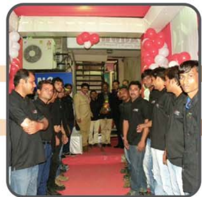
MEQ Hiroba (Exclusive Showroom): AIMS Enterprise City: Rajkot Inauguration Date: September 25, 2014