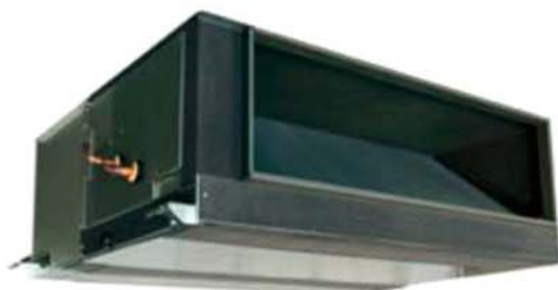
PEFY-P*VMH-E- High Static Duct Type