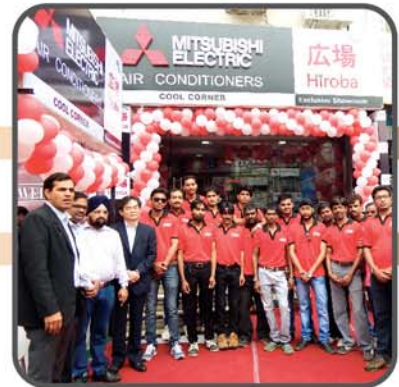
MEQ Hiroba (Exclusive Showroom): Cool Corner City: Indore Inauguration Date: September 5, 2014