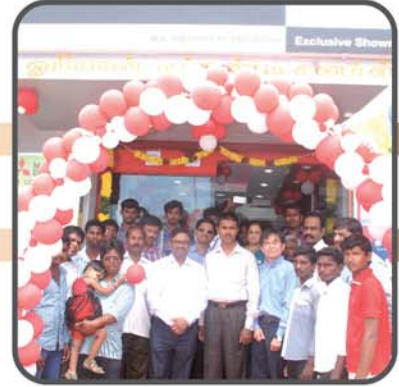
MEQ Hiroba (Exclusive Showroom): Orion Airconditioners City: Tirupur Inauguration Date: September 1, 2014