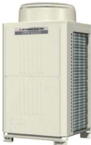
PUHY-P*YHA-E- Outdoor Units