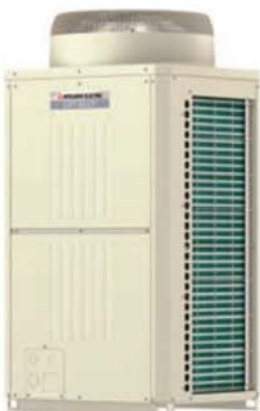
CM VRF ODU